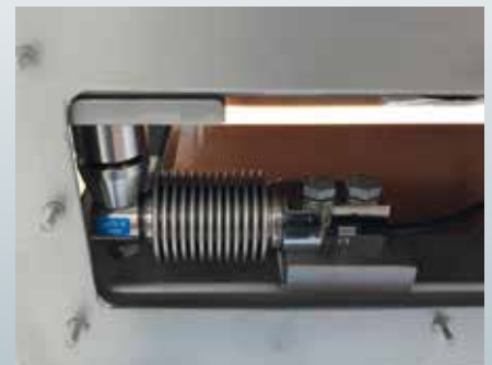
High-precision and acid-resistant load cell