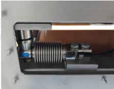
High-precision, fully automatic scale for the production of AGM and VRLA batteries Fig.: acid-proof load cell

MACHINES FOR BATTERY PRODUCTION AND SPECIALISED MECHANICAL ENGINEERING